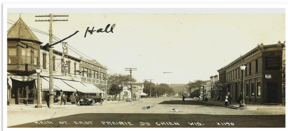
Looking east from the corner of Blackhawk and Wacouta. A vintage postcard.

Please send your tax-deductible contribution to the PdC Historical Society at 717 S. Beaumont Rd., Prairie du Chien, WI 53821.